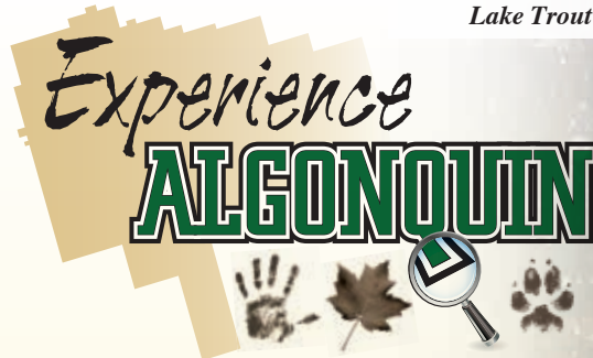
Lake Trout spawning workshop on Lake Opeongo

Appealing to both the curious beginner and the experienced enthusiast, Experience Algonquin workshops offer a broad range of Algonquin Park-related courses. We bring expert instructors from communities within and around Algonquin Park to share their passion and expertise on a variety of recreational and natural history topics. As a participant, you will work closely with instructors in a small group setting, taking home new skills and knowledge, as well as field guides and tools needed to pursue your interest further.